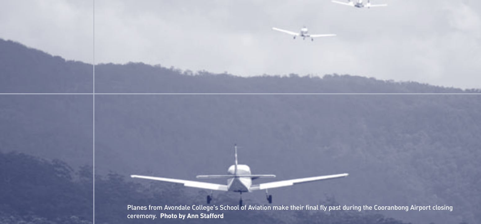
Planes from Avondale College's School of Aviation make their final fly past during the Cooranbong Airport closing ceremony.