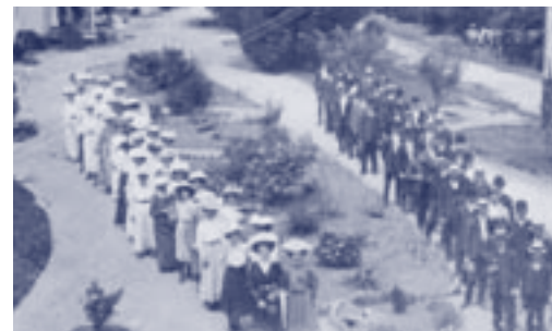
The Avondale School for Christian Workers was open "to all worthy persons of both sexes."