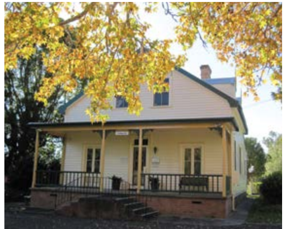
Sunnyside, the historic residence of Ellen G. White, adjacent to the South Sea Island Museum.

A revelation not of Ellen White as writer but resident. TEACH