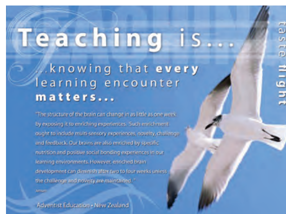
["Teaching is...": Lanelle Cobbin]

“Implementing such practices will foster in children the disposition to be creators rather than consumers”